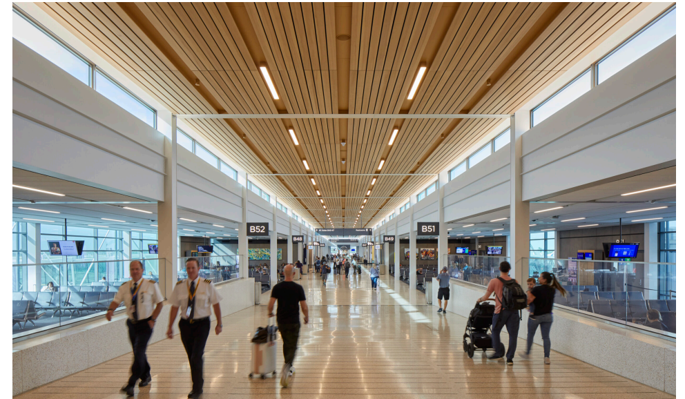
All images of the new MCI airport are courtesy of SOM

This is a program initiative project of the nonprofit public charity, Kansas City Area Youth Jazz Inc.